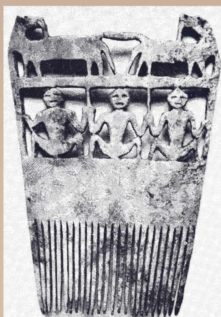
Figure 3: A bone comb with "hockers" from a Seneca Iroquois site (Wray 1963: Plate 3[13]).

Intrigued by the unique nature of this artifact, and unable to find comparable specimens in readily available literature, we sent a sketch and description to several dozen colleagues in eastern North America, asking for information on similar examples. The answer came from Robert Funk and George Hamell of the New York State Museum. The squatting figure is termed a "hocker," and is found throughout the world (Covarrubias 1954) (Figures 2). Hockers are apparently rare east of the Mississippi River, although they are common in Seneca Iroquois art (especially on bone combs) during the period from A.D. 1670 to 1700 (Wray 1963; Hamell 1979) (Figure 3). Funk reports that - even at ca. A.D. 1460 - our specimen would represent one of the earliest hockers ever found in the East. Hamell reports that the earliest known example - from a Canandaigua phase Owasco site in New York - consists of continuous bas-relief hockers around the bowl of a ceramic elbow pipe and dates to ca. A.D. 1130.