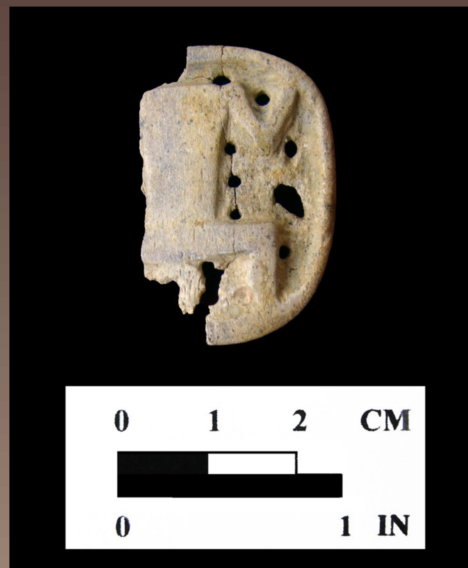
Figure 1: Bone carving from the Rosenstock site.

In their study of ancient symbolism, Schuster and Carpenter (1996:82-83) view hockers - especially when used as part of a repeated design - as an element depicting genealogy. Each hocker represents an ancestor, and the headless nature of some hockers is seen as deliberate and symbolic, i.e., ancestors, in general, are dead. They (Schuster and Carpenter 1996:104, 113) also discuss the use of "excerpts" where a single figure taken from a genealogical pattern is used as a medallion and, in some societies, assigned the name of a deceased person. Other interpretations suggest that the Rosenstock hocker might represent the Iroquoian notion of a "doorkeeper," or that the drilled holes were "joint marks" used in divination (Hamell, Carpenter, personal communication 1992).